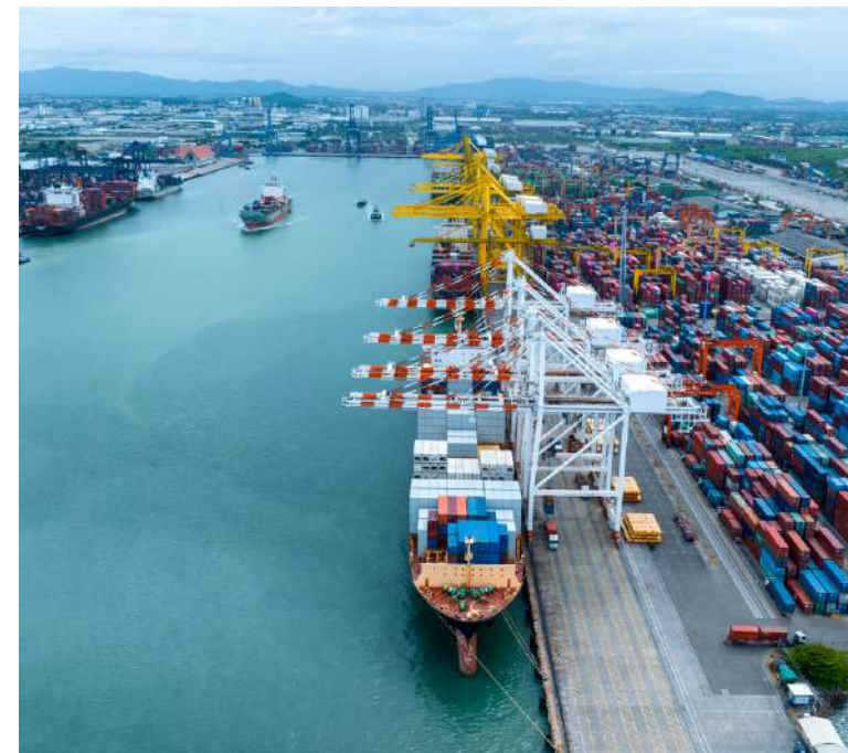
COMMODITY IMPORT & EXPORT