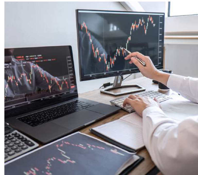
CORPORATE FINANCE & BANKING